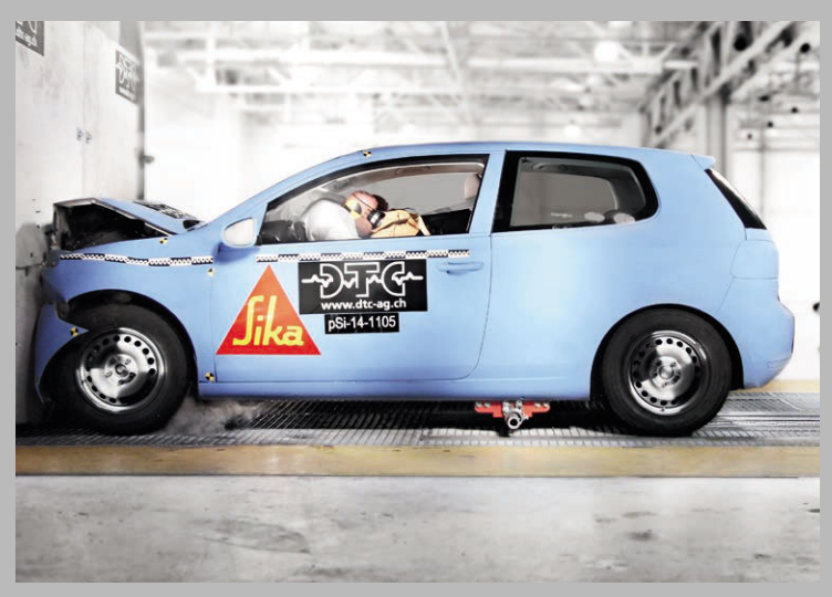
WITH SIKA YOU ARE ON THE HIGH ROAD TO SAFETY.

SikaTack<sup>®</sup> PRO is compatible with both installation processes offered by Sika. The Black-Primerless delivers the fastest application process for the standard auto glass related applications whereas using the All-Black solution lets you keep inventories smaller by just using one Pre-Treatment product for all process steps.