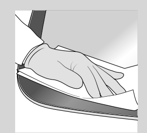
5<sup>th</sup> step: Dry with paper towel