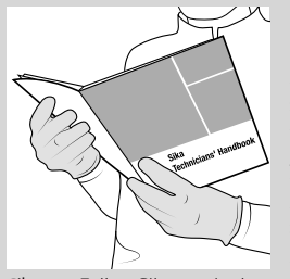
6 <sup>th</sup> step: Follow Sika required procedure – see Sika Technicians' Handbook