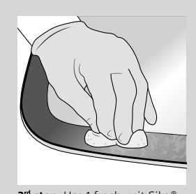
3<sup>rd</sup> step: Use 1 fresh unit Sika® Cleaner PCA. Start cleaning ceramic frit