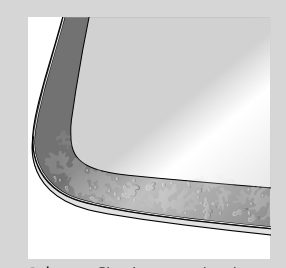
2<sup>nd</sup> step: Check contamination