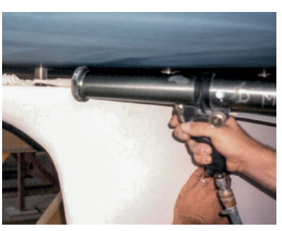
The adhesive is applied