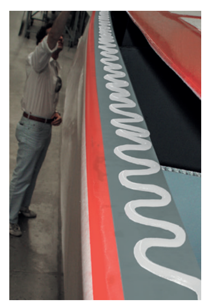
Hull and deck are brought together

Do not use Sika® Aktivator or any other cleaning agent or solvent for cleaning purposes