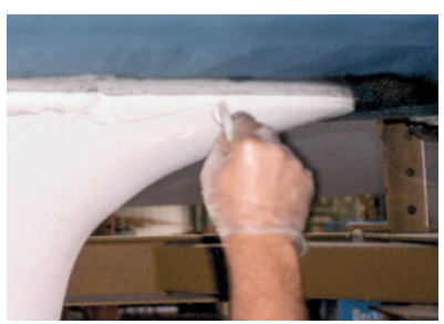
The joint is tooled off and finished

For the preparation of other substrates, please refer to the Pre-Treatment Chart for Sika Marine Applications.