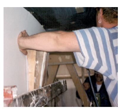
A keel is carefully slid into position

Flash-off: 10 minutes (min) to 2 hours (max)