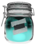
Full immersion in test liquid

Sikaflex PRO-3 Purform is frequently and successfully used in floor joints where often chemical resistance is required. Therefore, the chemical resistance against several chemicals is tested according to EN 14187-6. These tests are carried out with fully immersed H test specimen. That means 4 site immersions where in practice we have only have one site immersion. This is a worst-case scenario which guaranties that the sealant will be tight for the period and no contamination of the soil or ground water can occur.