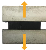
Elongation after immersion