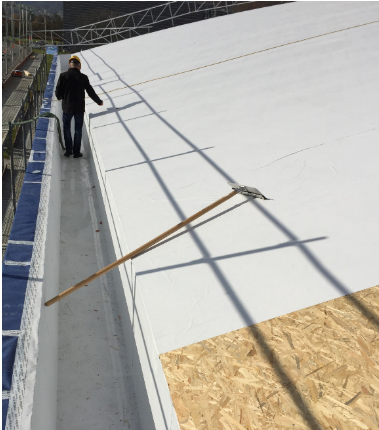
Detail formation gutter