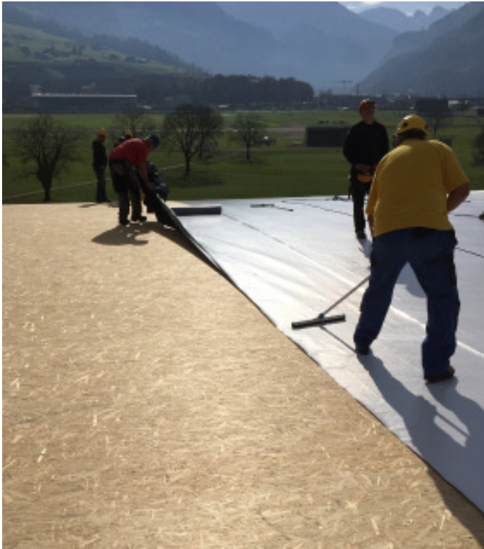
Easy to apply, almost no wrinkles