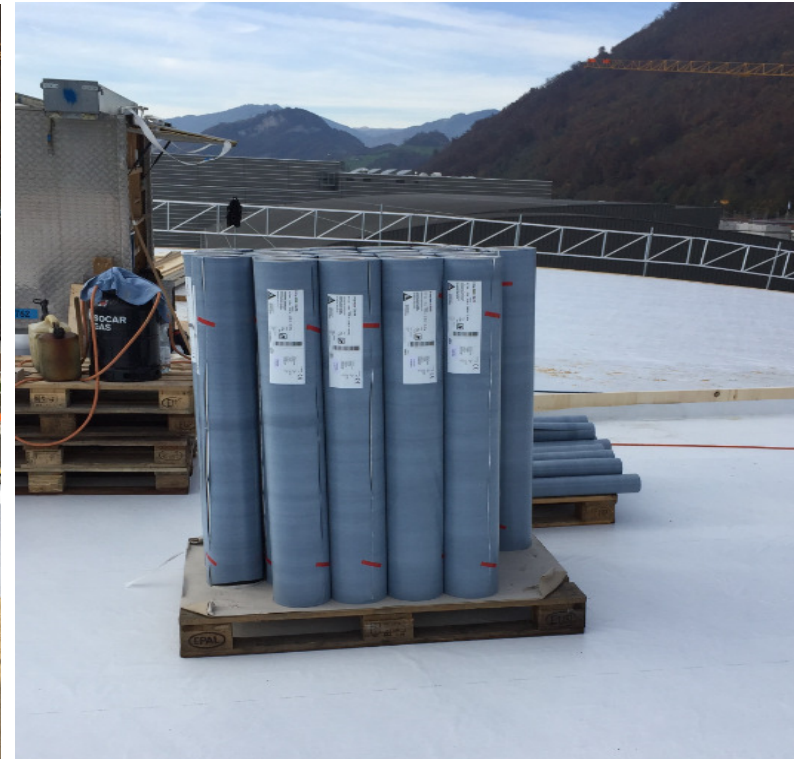
Pallet contains 24 rolls (2016 m 2 ) Roll size 1.20 x 70 m