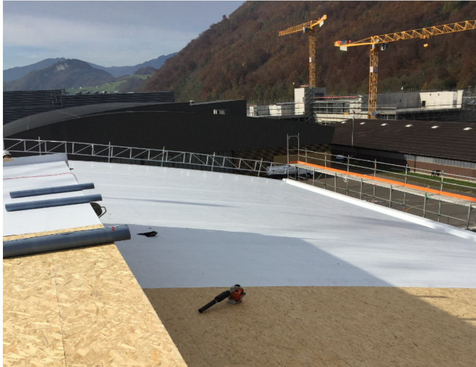
Partly finished surface