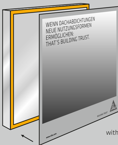
Metal to metal with Sikaflex®-552 AT or Sikaflex®-953 .